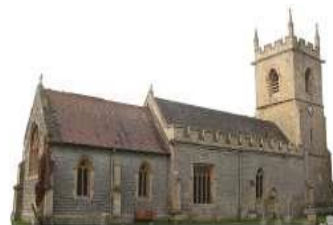
Hinton on the Green